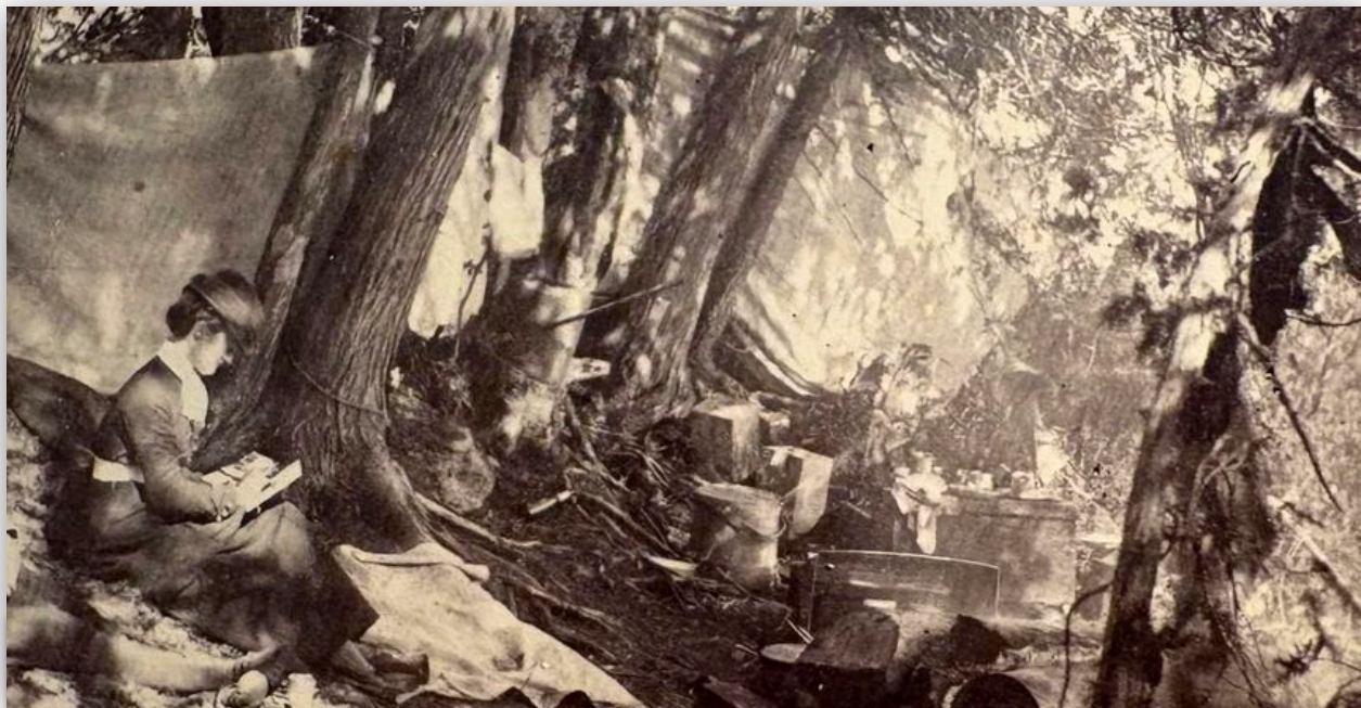
Ellen Twisleton Vaughan sketching at campsite in the North Woods of Maine, 1879