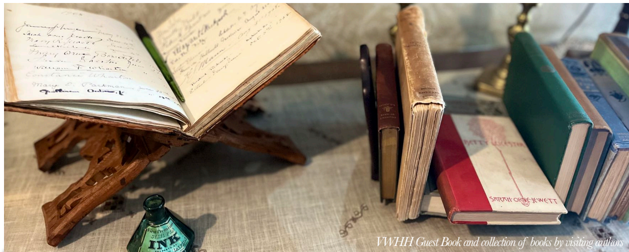
VWHH Guest Book and collection of books by visiting authors