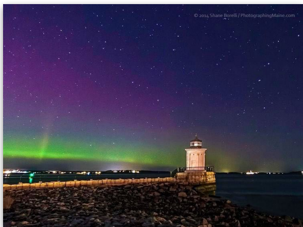
In this 2014 photograph by Shane Borelli the aurora borealis appears over Portland, behind the Portland Breakwater Light

Ultimately, the committee which decided on the seal incorporated all of Vaughan’s symbols except for this one. Which state does depict the aurora borealis on its seal?