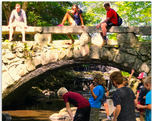
Hall-Dale Summer Recreation Program 5th graders race twig boats in Vaughan Brook.