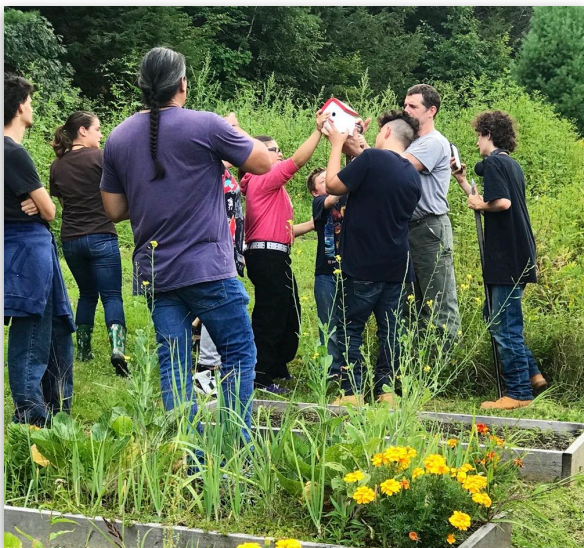
Augusta Boys & Girls Club teens install birdhouse in VWHH garden. The teens made the birdhouse in their wood shop and donated it to VWHH this fall.