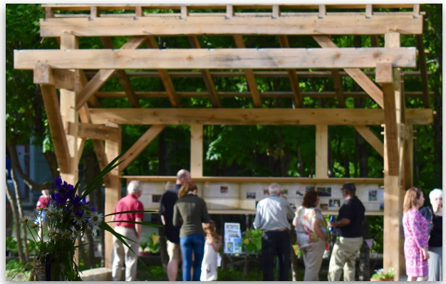
Students at the Kennebec Valley Community College cut and donated the timbers for our new outdoor cooking shelter! The shelter was completed in the fall and will be ready for cooking under in the spring of 2020.