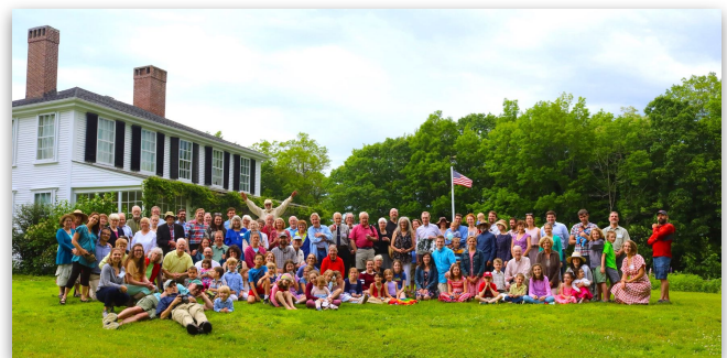
2019 Garden Party participants carry on a portrait tradition!