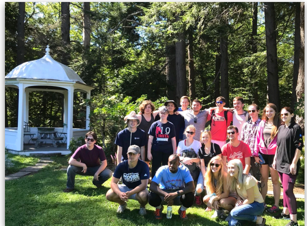
University of Maine students residing at the new Stephen's Commons dorms pose for a photograph in the VWHH garden after a morning of trail work in Vaughan Woods as part of their freshman orientation in August.